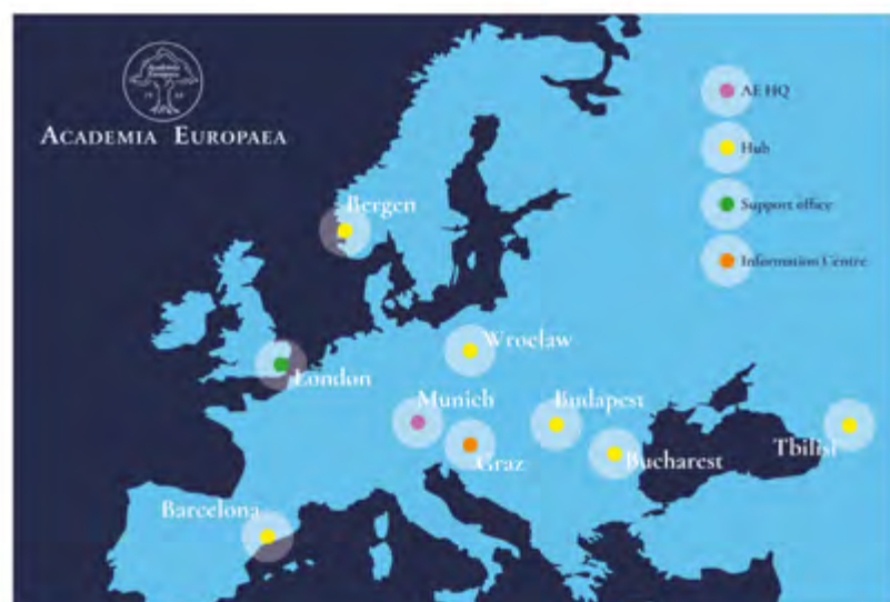
A map of Academia Europaea locations in Europe.