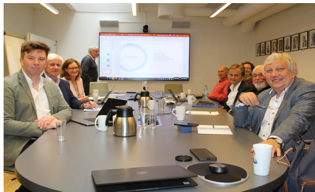
The AE-Bergen Hub Steering Group.