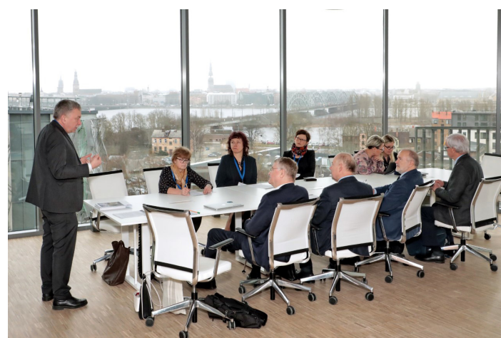
Signing of a Conference Riga Declaration on cooperation, science and innovation in the Baltic Sea Region.