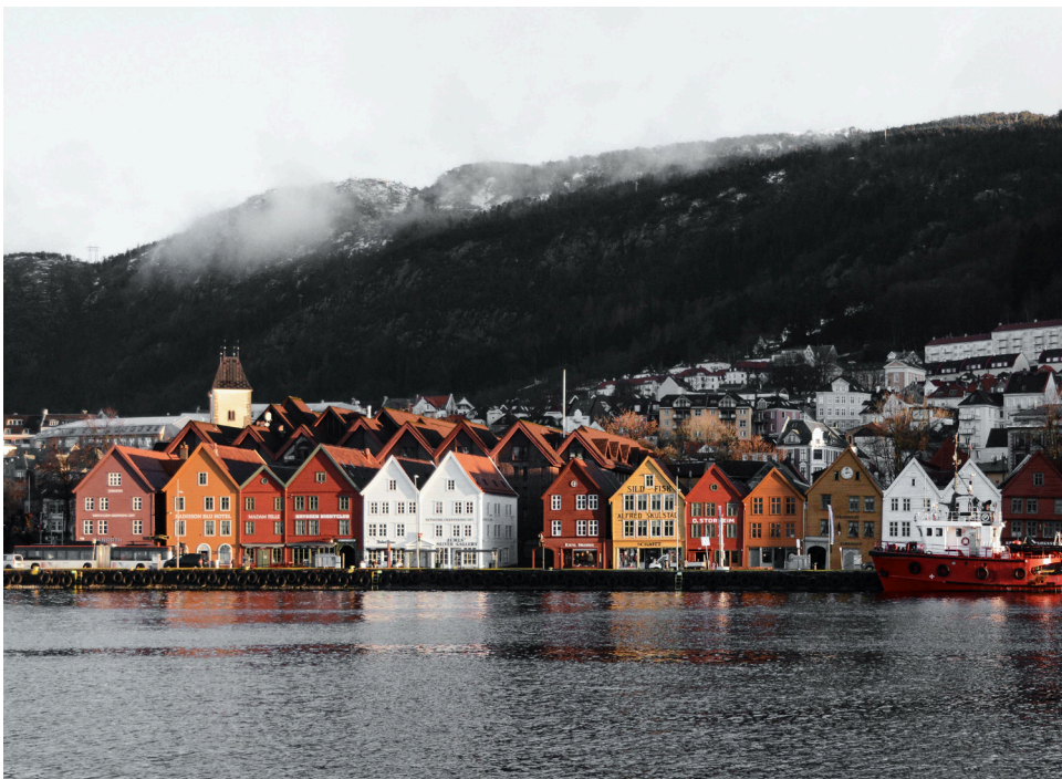
Bergen – our beautiful home city.