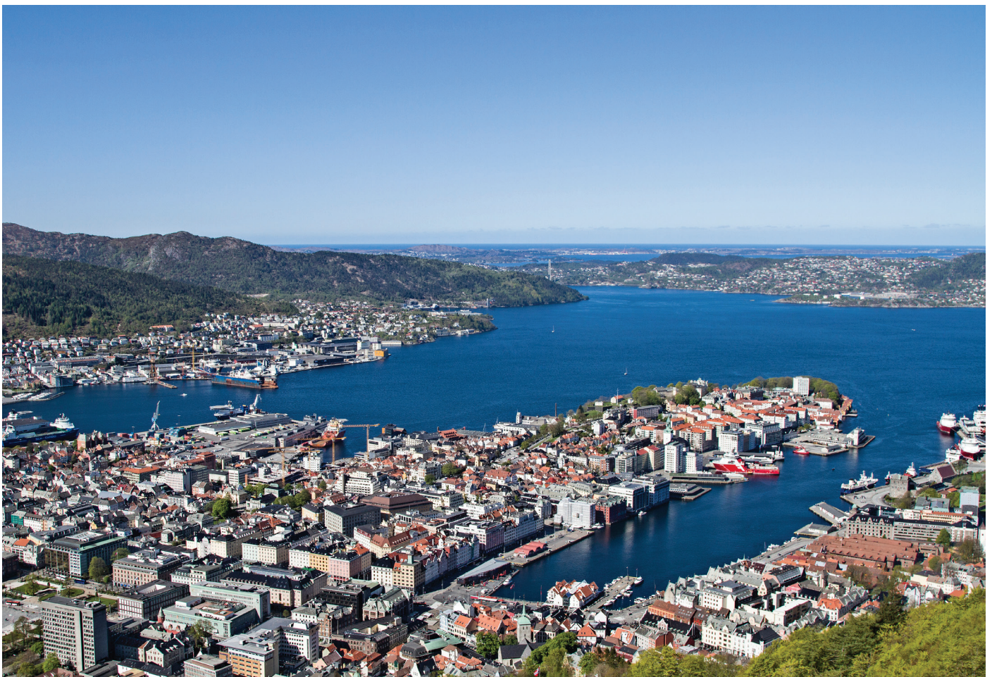
The home city of the Academia Europaea Bergen Knowledge Hub

A complete Strategic plan will be further elaborated and adopted in 2020.